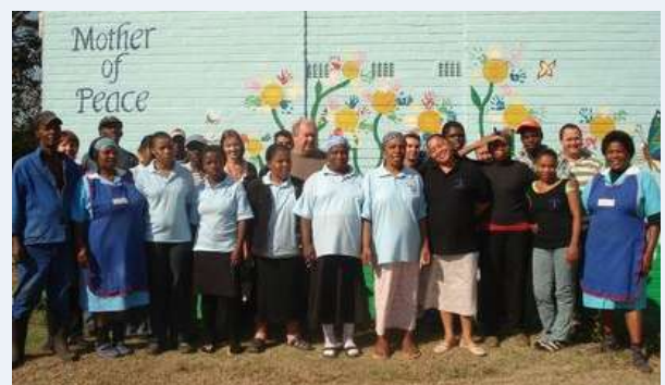
Some of the Mother of Peace Staff

All our expenses are strictly monitored by the Executive and Management Committees who meet weekly (EXCO) and monthly (MANCO)